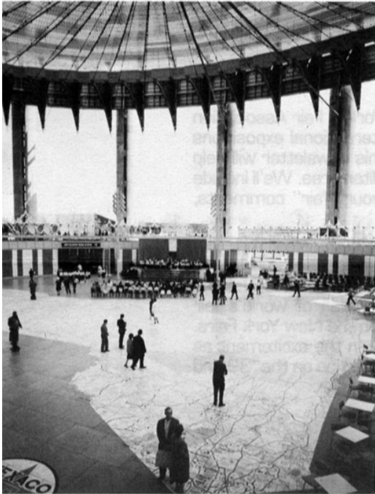
New York State Pavilion, c. 1964

You have passed it a hundred times, driving along the Long Island or Van Wyck Expressways or Grand Central Parkway...Flushing Meadow-Corona Park, over 1,200 acres of recreational parkland and one of the city's almost undiscovered treasures.