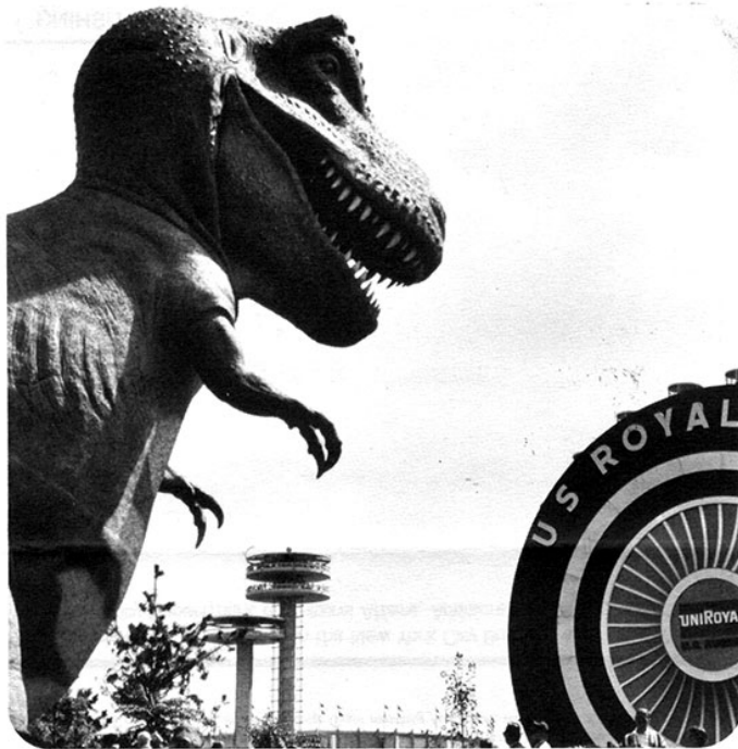
View of the '39 (left) and '64 (above) fairgrounds. Part of the Permanent Collection.